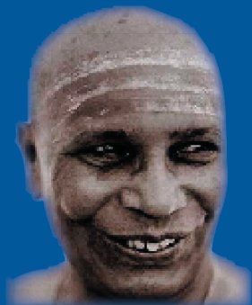
Sri K. Pattabhi Jois, the Father of Ashtanga Yoga